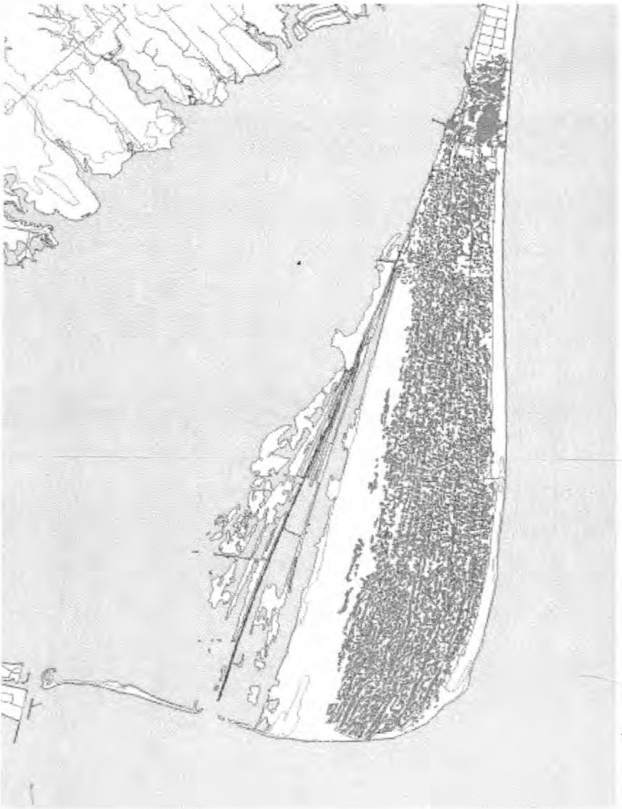
Figure 3. Interpreted canopy gap profile for 1978 at Rondeau Provincial Park.