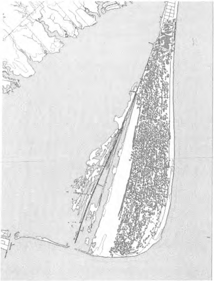
Figure 2. Interpreted canopy gap profile for 1972 at Rondeau Provincial Park.